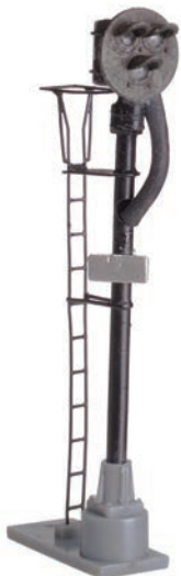
ITEM # 70 000 102 N SINGLE HEAD TYPE G SIGNAL

From basic layouts to large club empires, the All Scales Signal System opens the gateway to enhanced prototypical operation and realism and ensure that "You're on the Right Track...with Atlas!®"