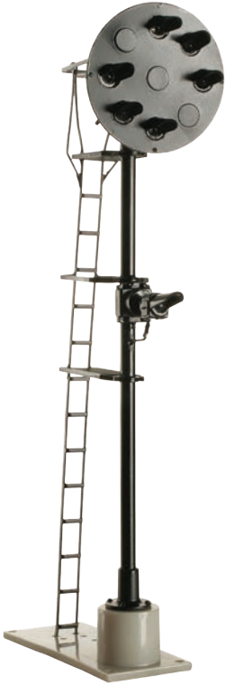
ITEM # 70 000 064 O COLOR POSITION LIGHT SIGNAL, SINGLE HEAD

For More Information and to Order, Please Contact Your Atlas Authorized Dealer