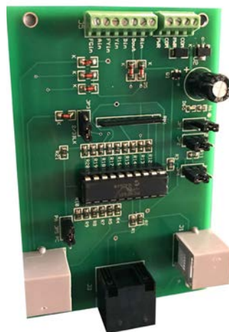
ITEM # 70 000 046 UNIVERSAL SIGNAL CONTROL BOARD