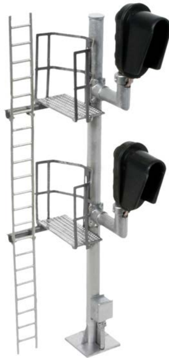
ITEM # 70 000 097 HO HOODED MODERN DOUBLE SIGNAL, LEFT