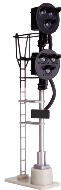
ITEM # 70 000 077 HO DOUBLE HEAD TYPE G SIGNAL