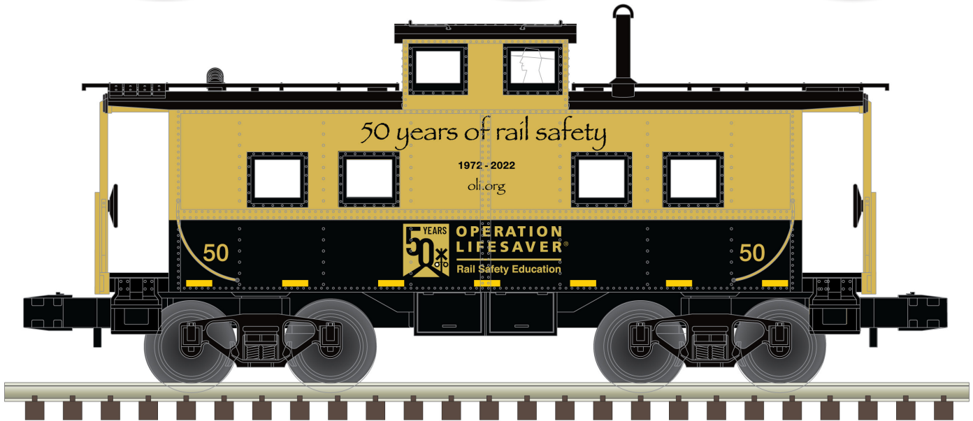
Northeast Steel Caboose - Operation Lifesaver 50th Anniversary

Operation Lifesaver 50 th Anniversary Caboose A great match for our previously announced Operation Lifesaver GP-40 locomotive!