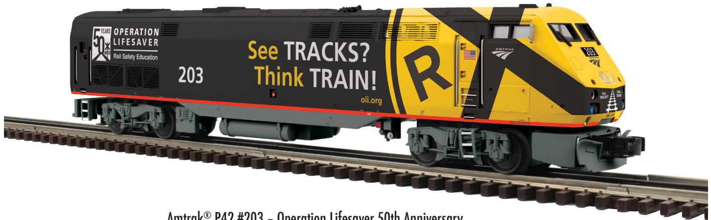
Amtrak® P42 #203 – Operation Lifesaver 50th Anniversary