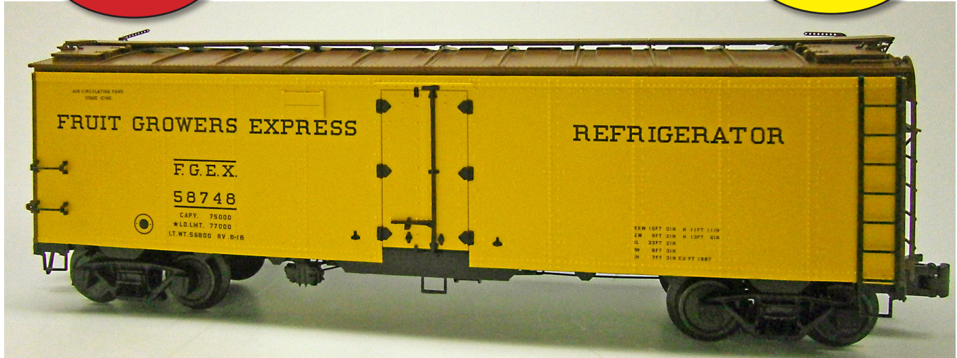
Fruit Growers Express