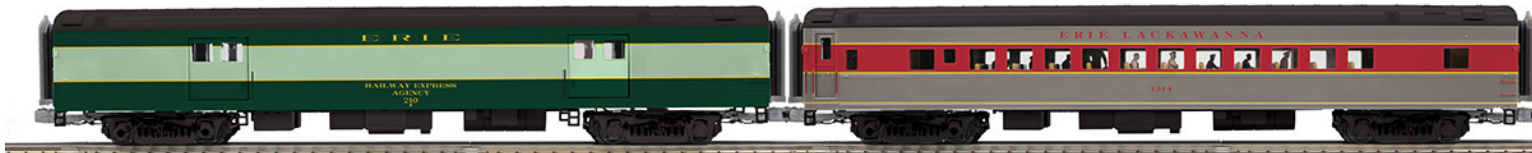
Erie Lackawanna 4 car set