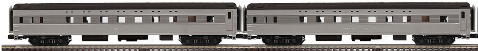
New York Central* 1940 4 car set