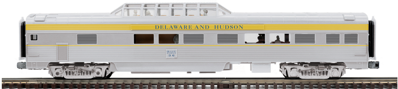
Delaware & Hudson

New York Central* MTH Hudson Steam Locomotive announcement: https://www.mthtrains.com/news/811