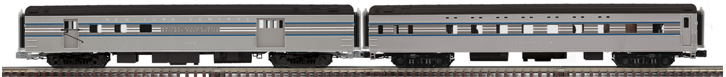
New York Central* 1938 2 car set