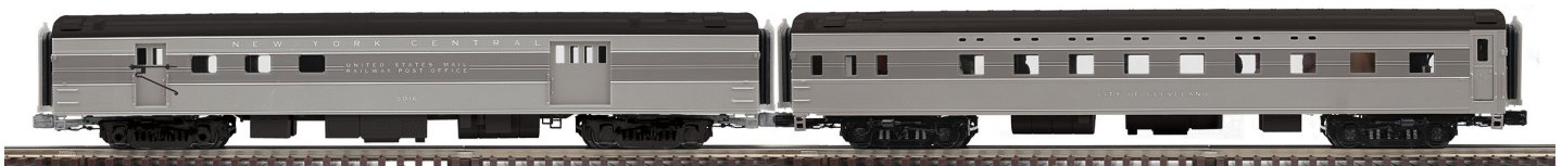
New York Central* 1940 2 car set