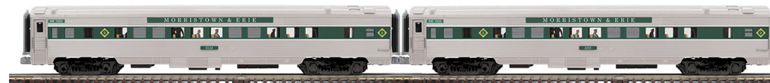
Maine Eastern 4 car set

4 Car Set - Perfect match for Atlas' previously announced Main