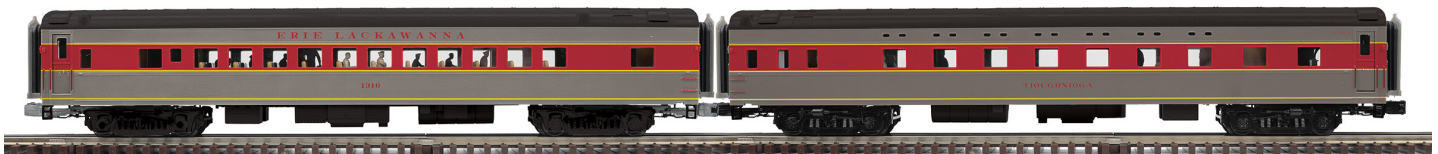
Erie Lackawanna 2 car set