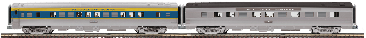
Delaware & Hudson 2 car set

New York Central* MTH Hudson Steam Locomotive announcement: https://www.mthtrains.com/news/811