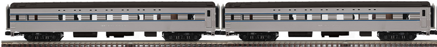
New York Central* 1938 4 car set