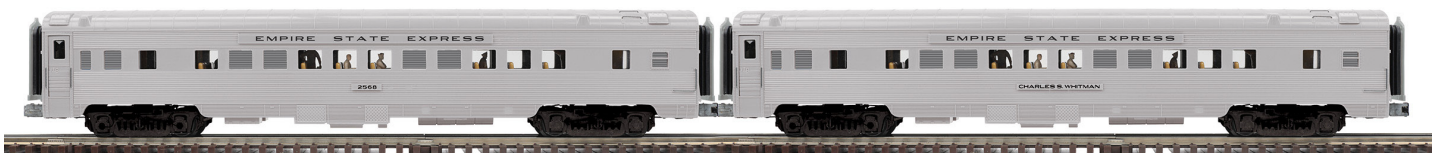
New York Central* Empire State Express 2 car set