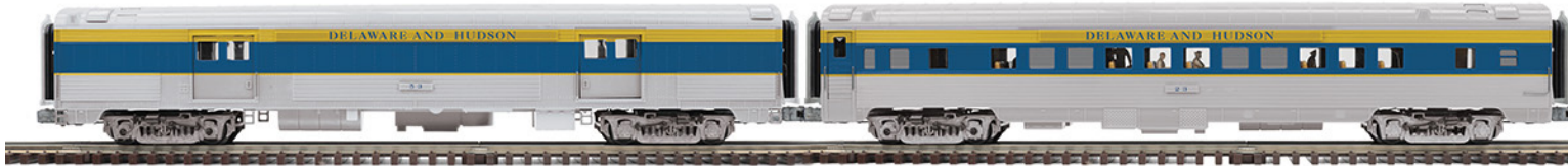
Delaware & Hudson 4 car set