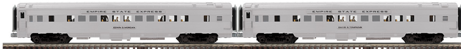
New York Central* Empire State Express 4 car set

4 Car Set - Perfect match for Atlas' previously announced Main