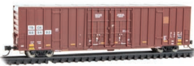
60' High Cube 'TBOX' Double Door Boxcar TBOX ex-AOK Rd# 889482 #123 00 130.....$54.98