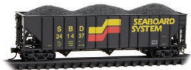
100-Ton 3-Bay Open Hopper Seaboard System Rd# 341437 #108 00 053.....$28.90