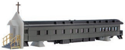
Chapel car with facade #144 00 300.....$32.95