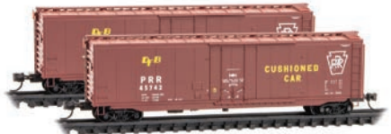
50' Standard Boxcar, Plug Door Pennsylvania #032 00 610....Rd# 45743.....$28.90 #032 00 611....Rd# 45747.....$28.90