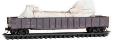
50' Fishbelly Gondola Union Pacific Rd# 30017 #105 44 271.....$30.95