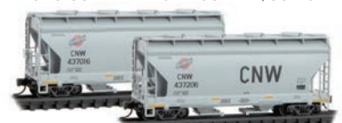
2-Bay ACF Covered Hopper Union Pacific ex-CNW #092 00 601....Rd# 437016.....$32.95 #092 00 602....Rd# 437206.....$32.95