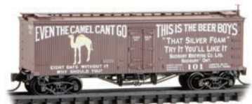
36' Wood Sheathed Ice Reefer Sudbury Brewing Rd# 101 #058 00 181.....$28.95