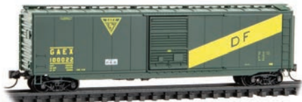
50' Standard Boxcar, Single Door GAEX Rd# 100022 #031 00 590.....$28.95