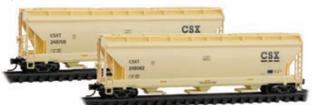
3-Bay ACF Covered Hopper CSX #094 00 930....Rd# 248082.....$34.95 #094 00 931....Rd# 248708.....$34.95