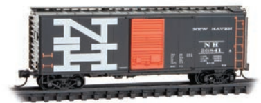
40' Standard Boxcar, Single Door New Haven Rd# 36841 #020 00 557.....$29.95