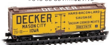
40' Double Sheathed Wood Reefer Jacob E. Decker & Sons Rd# 2879 #049 00 641.....$29.95