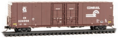
60' High Cube Double-Plug Door Conrail Rd# 220998 #102 00 320.....$32.95