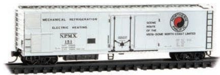
50' Mechanical Reefer Northern Pacific Rd# 151 #069 00 151.....$27.90