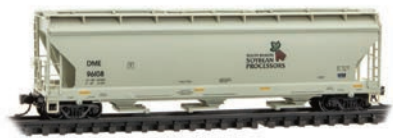
3-Bay ACF Covered Hopper Dakota, Minnesota & Eastern Rd# 96108 #094 00 910.....$34.95