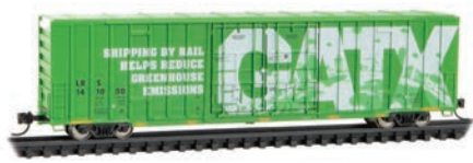
60' Rib Side High-Cube Boxcar GATX Rd# 141000 #123 00 080.....$51.98