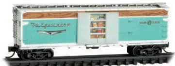
40' Wood Sheathed Boxcar APRIL FOOLS CAR "Frigerator" #042 00 160.....$28.95