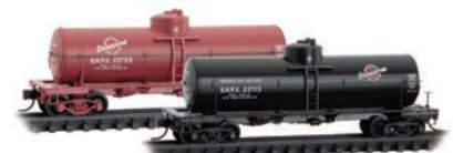
39' Single Dome Tank Car Shipper's Car Line #065 00 326....Rd# 23703.....$30.90 #065 00 336....Rd# 23713.....$30.90