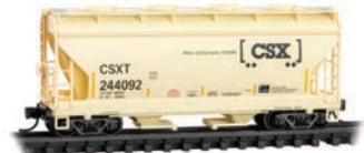
2-Bay ACF Covered Hopper CSX Rd# 244092 #092 00 650.....$33.95