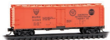
40' Steel Side Ice Reefer American Refrigerator Transit - BUDX Rd# 91553 #059 00 290.....$29.95