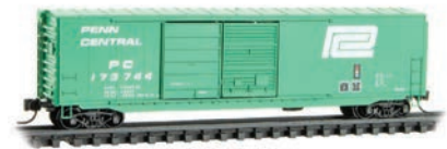
50' Standard Boxcar, Double Door Penn Central Rd# 173744 #184 00 040.....$29.95