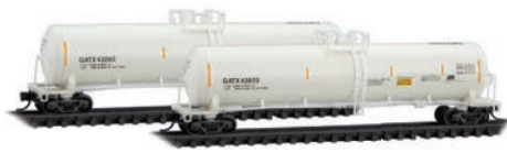
56' Modern Tank Car GATX #110 00 660....Rd# 43265.....$35.95 #110 00 661....Rd# 43833.....$35.95