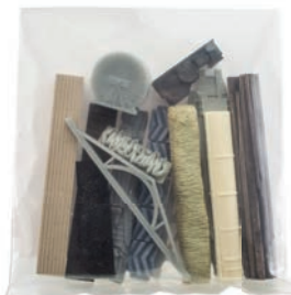
Load Variety 12-pk (contents may vary) #499 45 100...$24.95