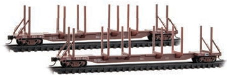
65' Modern Log Car Southern #115 00 130....Rd# 118001.....$29.90 #115 00 131....Rd# 118003.....$29.90