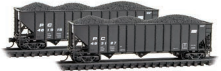
100-Ton 3-Bay Open Hopper Penn Central #108 00 660....Rd# 481915.....$28.90 #108 00 661....Rd# 483187.....$28.90