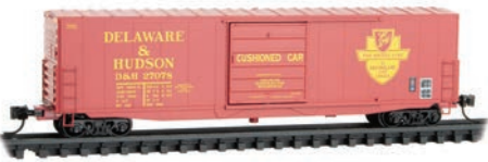
50' Standard Boxcar, Single Door Delaware & Hudson Rd# 27078 #180 00 420.....$29.95