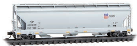
3-Bay ACF Covered Hopper Southern Pacific Rd# 496490 #094 00 970.....$34.95