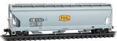
3-Bay ACF Covered Hopper Norfolk Southern POOL Rd# 850706 #094 00 980.....$34.95