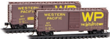
40' Standard Boxcar, Single Door Western Pacific #020 00 517....Rd# 22023.....$29.95 #020 00 518....Rd# 20772.....$29.95