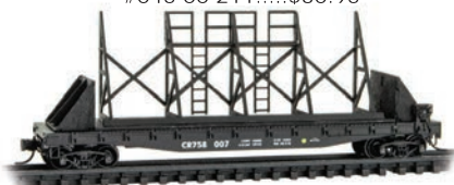
50' Fishbelly Flatcar Conrail Rd# 758007 #045 00 790.....$29.95