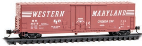
50' Standard Boxcar, Plug Door Western Maryland Rd# 36015 #181 00 350.....$28.95