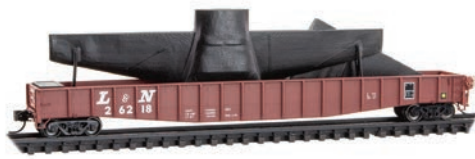
65' Mill Gondola Louisville & Nashville Rd# 26218 #107 00 110.....$34.95