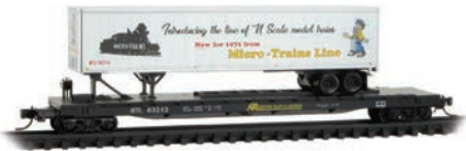
57' Converted TOFC Flat Car MT&L 70's & 80's w/Trailer Rd# 63213 #064 00 190.....$39.95