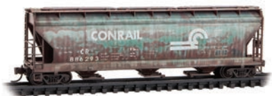
3-Bay ACF Covered Hopper CR Family Tree #1 CR ex-PC Rd# 886293 #094 44 960.....$30.95