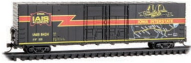
60' High Cube Double-Plug Door Iowa Interstate Anniversary Car Rd# 8424 #102 00 300.....$28.95