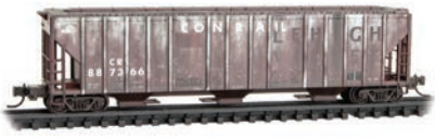
3-Bay Evans Covered Hopper CR Family Tree #3 CR ex-LV Rd# 887366 #099 44 400.....$30.95