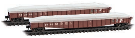
65' Mill Gondola Conrail #107 00 140....Rd# 593958.....$34.95 #107 00 141....Rd# 599610.....$34.95