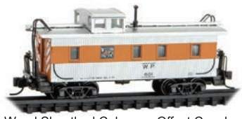
Wood Sheathed Caboose, Offset Cupola Western Pacific Rd# 601 #051 00 221.....$45.95