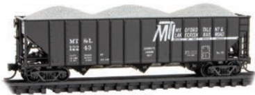
100-Ton 3-Bay Open Hopper MT&L 70's & 80's Rd# 12243 #108 00 570.....$28.95