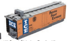
40' Steel Side Ice Reefer Kit Ice Storage House ex-PFE Rd# 3204 #059 00 280.....$34.95