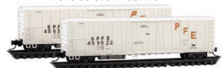
50' Rib-Side Mechanical Reefer Pacific Fruit Express #081 00 070....Rd# 456355.....$29.95 #081 00 080....Rd# 459922.....$29.95