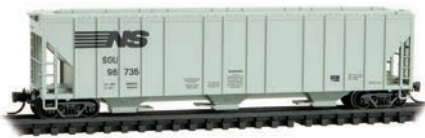
Evans 3-Bay Covered Hopper Norfolk Southern Rd# 96736 #099 00 390.....$28.95