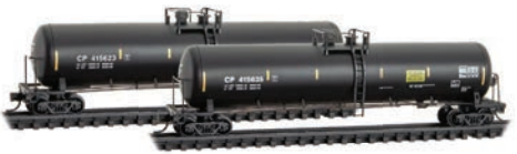
56' Modern Tank Car Canadian Pacific #110 00 610....Rd# 415623.....$35.95 #110 00 611....Rd# 415635.....$35.95