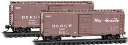
40' Standard Boxcar, Single Door Denver & Rio Grande Western #020 00 537....Rd# 50164.....$29.95 #020 00 538....Rd# 50167.....$29.95