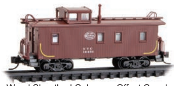
Wood Sheathed Caboose, Offset Cupola New York Central Rd# 19450 #051 00 380.....$33.90