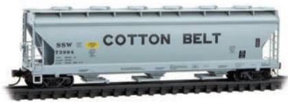
3-Bay ACF Covered Hopper Cotton Belt Rd# 73994 #093 00 210.....$33.90