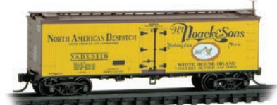
36' Wood Sheathed Ice Reefer Noack & Sons Rd# 3116 #058 00 603.....$29.95