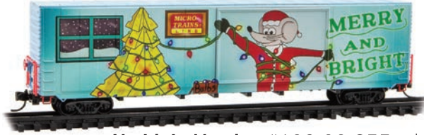
No Light Version #102 00 855...$29.95

Micro-Mouse explored an ancient tomb, deciphering hieroglyphs.