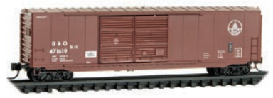
50' Standard Boxcar, Double Door Baltimore & Ohio Rd# 471619 #184 00 030.....$30.95