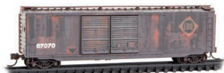
50' Standard Boxcar, Double Door CR Family Tree #2 - EL ex-Erie Rd# 67070 #034 44 500.....$30.95