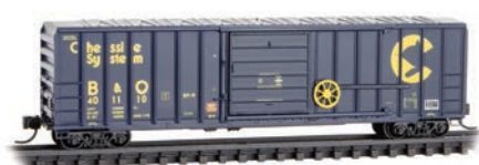
50' Rib Side Boxcar, Single Door B&O Chessie System Rd# 401110 #025 00 356.....$30.95