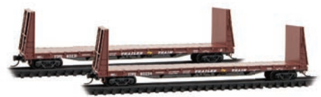
61' Bulkhead Flatcar w/ Uprights TTX #054 00 480....Rd# 80231.....$29.95 #054 00 481....Rd# 80234.....$29.95