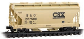
2-Bay ACF Covered Hopper CSX Rd# 227588 #092 00 640.....$31.95