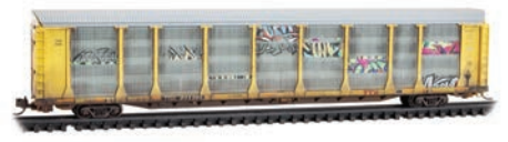
Tri-Level Enclosed Autorack Weathered TTX Rd# 851005 #111 44 490.....$65.95