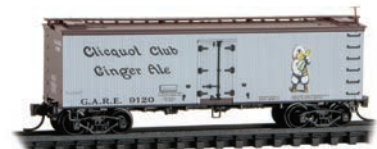
36' Wood Sheathed Ice Reefer Clicquot Club Ginger Ale Rd# 9120 #058 00 610.....$29.95