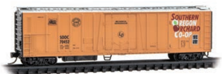
50' Rib-Side Mechanical Reefer MT&L 70's & 80's SOOC Rd# 70452 #070 00 090.....$29.95