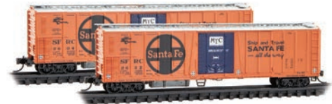
50' Rib-Side Mechanical Reefer Atchison, Topeka & Santa Fe #070 00 120....Rd# 2604.....$30.95 #070 00 121....Rd# 2632.....$30.95