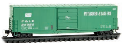
50' Standard Boxcar, Single Door Penn Central / P&LE Rd# 32052 #180 00 450.....$29.95