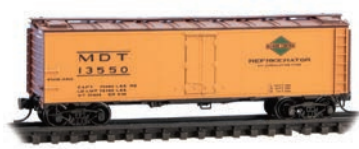
40' Steel Side Ice Reefer Merchants Despatch - IC Rd# 13550 #059 00 270.....$28.95